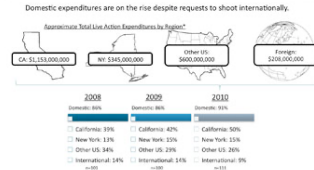
Q231. In 2010, what percentage did you SPEND in each of the following regions? *Numbers are estimates extrapolated from the mean to actual number size. Any fluctuation is attributable to rounding.

While expenditures in California have fluctuated partly due to out-of-state incentive activity, New York expenditures have remained steady at 15% of all live-action expenditures since 2009. Production in Illinois and Florida have also remained steady, coming in at 5% and 2.3% respectively, of total live action expenditures. The Southeast Region outside of Florida (Georgia, North Carolina, South Carolina) accounts for 3.43% of those expenditures and has grown significantly in recent years. 91% of all expenditures took place domestically compared to 9% abroad. This decrease in spend abroad is partly attributable to the